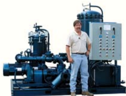
240 GPM Coalescer System

Designed to rapidly remove water and particulates from diesel fuel, fuel oil and most other hydraulic/lubricating oils. Coalescing technology outperforms centrifuges, are simpler to use, cost less to maintain and are lower in initial purchase price. Designed to run continuously in an outdoor environment, virtually no mechanical maintenance is needed.