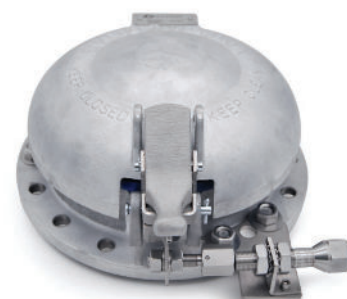
Thief Hatch Monitoring System with GO™ Switch

The GO Switch Thief Hatch Monitoring Kit is designed to fit any thief hatch model. This kit features GO Switch Model 73 which precisely monitors the hatch positioning, ensuring emissions are under control and hatches are fully sealed at all times. Its unique, robust bracket design guarantees no false signaling will occur. Model 73 also does not draw power so the battery life on wireless transmitters is greatly improved.