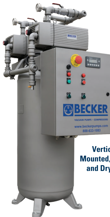
Vertical Tank Mounted, Lubricated and Dry Systems

For Pentaplex and Sextuplex system performance, contact factory.