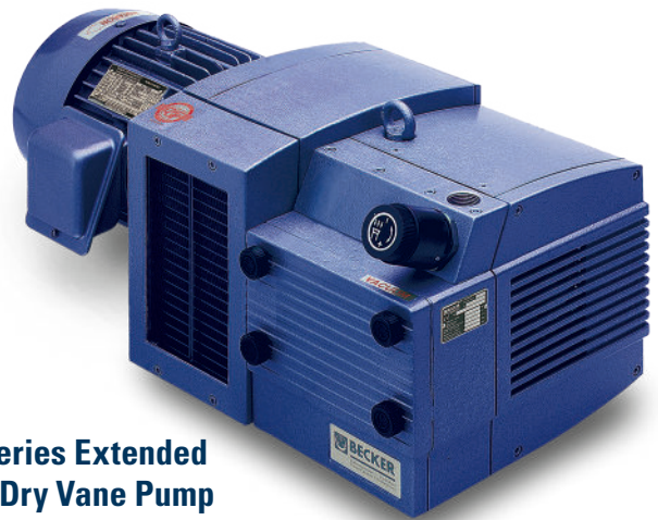
X-Series Extended Life Dry Vane Pump