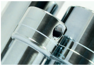
Comprehensive Range 725, 1450 and 5000 psig (50, 100 and 350 barg) models available

Available in four filtration grades from 5 to 0.01 Micron and Activated Carbon, our stainless steel high pressure range guarantees maximum contaminant removal and offers varied flow rate capacities of 725, 1450 and 5000 psig (50, 100 and 350 barg).