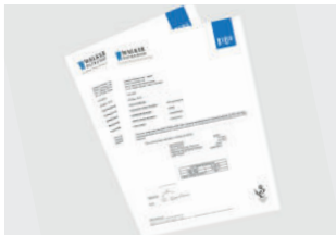
Performance Guaranteed Each filter is hydrostatically tested prior to despatch